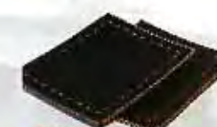
EDL041 Mouse Pad