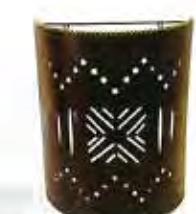
EDL075 Lampshade Wall Mount Small