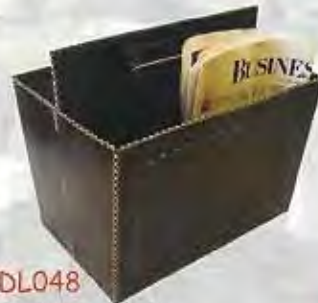
EDL048 Magazine Rack