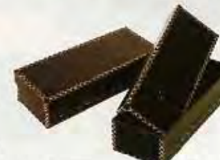
EDL050 Pencil box