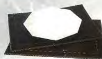
EDL071 Place Mat