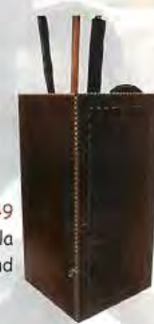
EDL049 Umbrella Stand