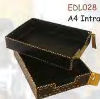
EDL028 A4 Intry