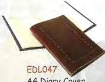
EDL047 A4 Diary Cover