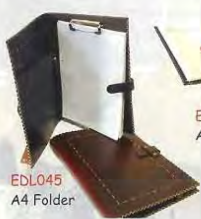
EDL045 A4 Folder