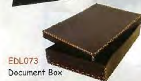
EDL073 Document Box