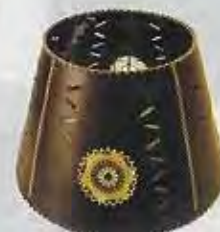
EDL040 Lamp Shade Conical