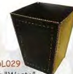
EDL029 Bin "Waste"