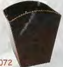
EDL072 Bin Small "Waste"