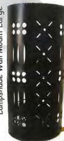
EDL076 Lampshade Wall Mount Large