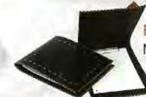
EDL044 Note Pad Holder