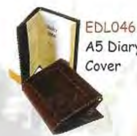
EDL046 A5 Diary Cover