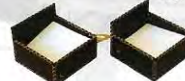
EDL030 Note Box