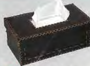
EDL074 Tissue Box