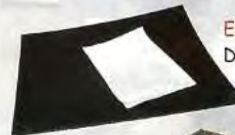
EDL035 Desk Pad