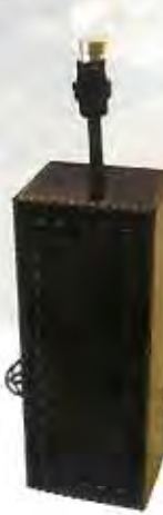
EDL077 Table Lamp Base & Electric Fitting