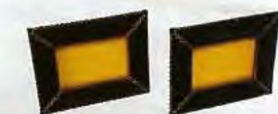
EDL078 Picture Frame Landscape